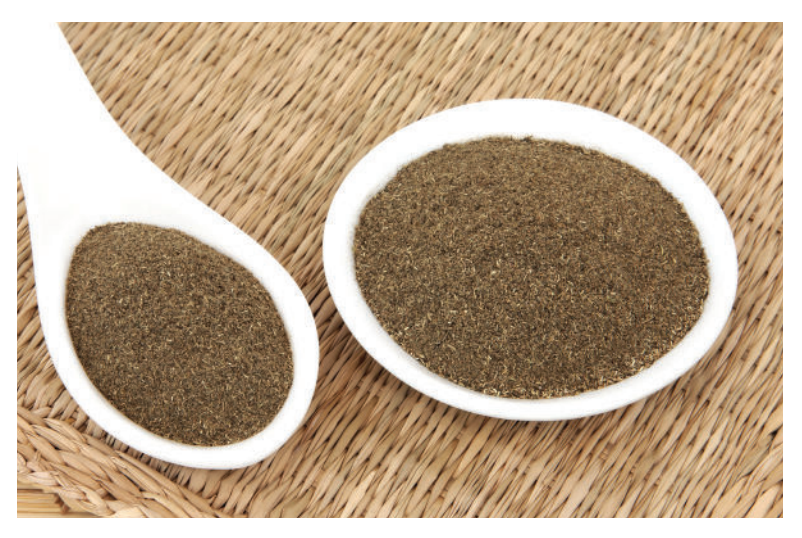
Bhringraj Indian Ayurvedic herbal medicine. Natural remedy for hair loss and premature graving.

Amla or Indian Gooseberry also provides amazing benefits for hair. Amla is rich in phyto-nutrients, vitamins and minerals. These help increase blood circulation within the scalp and stimulate hair growth. The vitamin C